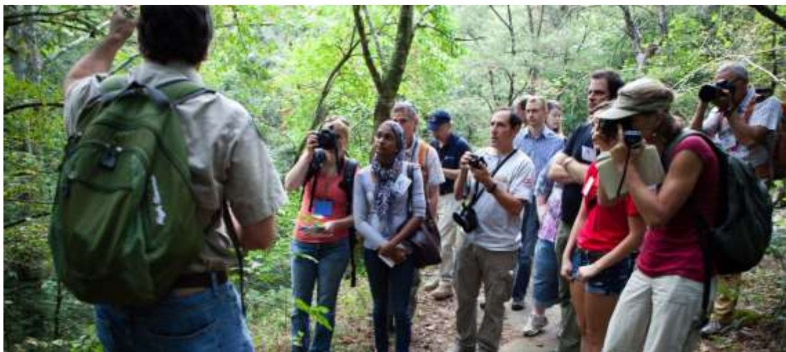
Biodiversity Tour at the SEJ Annual Conference in Chattanooga.