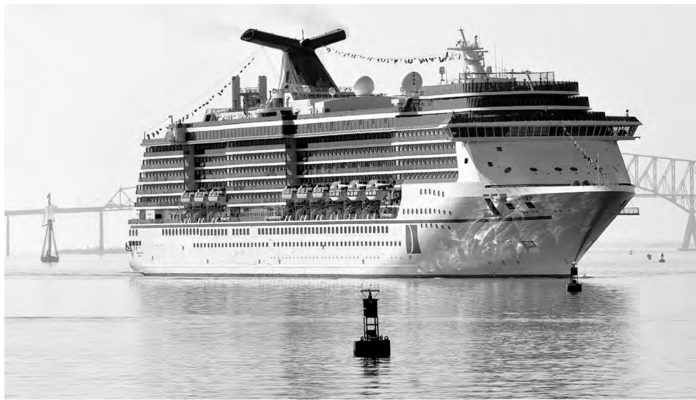
BALTIMORE SUN PHOTO 2009

Carnival Cruise Lines has threatened to pull its business from Baltimore over a pending air-quality regulation that would require ships such as the Carnival Pride to burn cleaner fuel. The EPA estimated that burning cleaner fuel would add $7 per day, on average, to individual cruise fares.