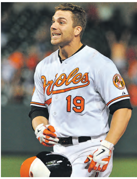
First baseman Chris Davis has become a league-leading slugger during his time with the Orioles.